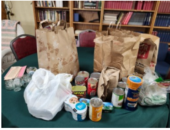
(A woman and her daughter arrived to access food during our forum.)

Our February Forum was held on the 2nd at St. John the Divine Episcopal, Springfield. Fellowship began a little before 10:00 and included many members donating food for the church's Saturday food pantry.